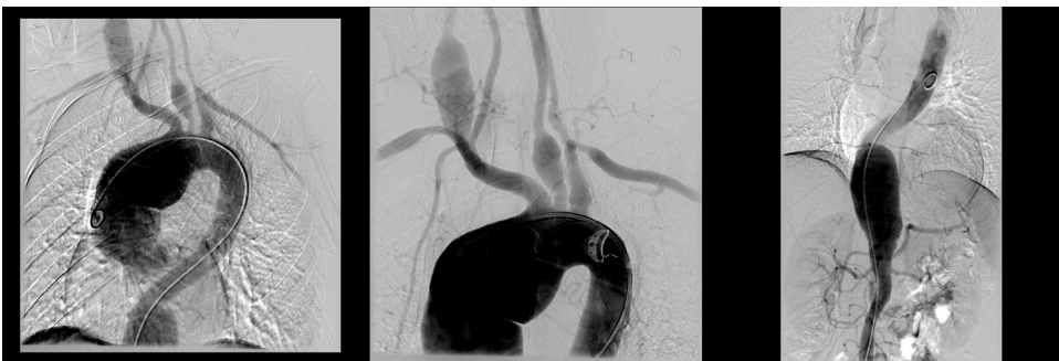
Figure 3. DSA of aortic arch and thoracoabdominal aorta showed aneurysms in ascending aorta, bilateral common carotid arteries and thoracoabdominal aorta (A,B,C).